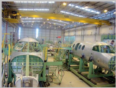
Phenom 100 sub assembly at Botucatu facility

Tests – Several development and certification flight tests have been performed to date, such as low- and high-speed characteristics, stalls, flutter, and natural ice conditions, which will allow the aircraft to be certified for flying into known icing conditions, when it enters service later this year. Crosswind tests were held in Punta Arenas, Chile, earlier this year, and operational tests in high altitude airports were recently concluded in Cochabamba, Bolivia. One test aircraft has just come back from the south of Argentina, where it was performing cold weather tests.