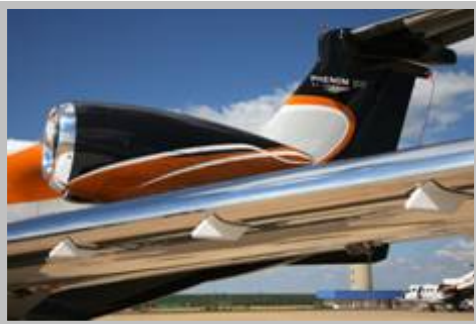
Second Phenom 300 – moments before the flight