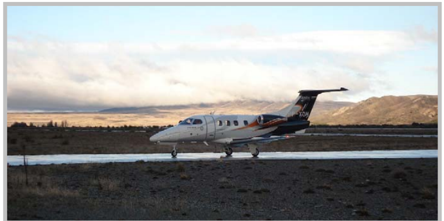
Phenom 100 Cold Weather campaign - Bariloche, Argentina

Ground evaluations included ground vibration, lightning, HIRF (High Intensity Radio Frequency) and cold soak, the latter completed last April at the McKinley Climatic Laboratory at Eglin Air Force Base, in Florida, USA. All structural static tests have also been concluded, while the primary structure components made of composite materials have completed both fatigue and static certification tests.