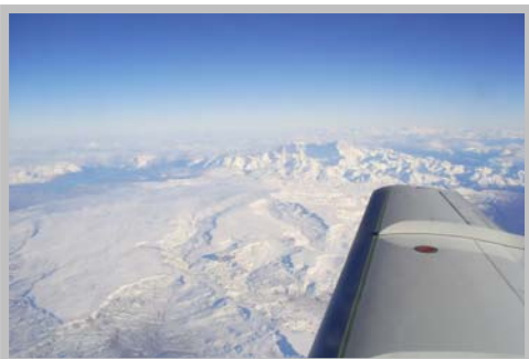
Moments of the Phenom 100 certification campaign