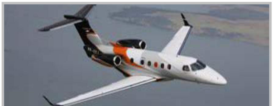
Second Phenom 300 first flight

The Phenom jets are clean-slate designs, envisioned to offer premium comfort, outstanding performance and low operating cost. Embraer has partnered with renowned aviation industry leaders to manufacture and support the Phenom 100 and Phenom 300.