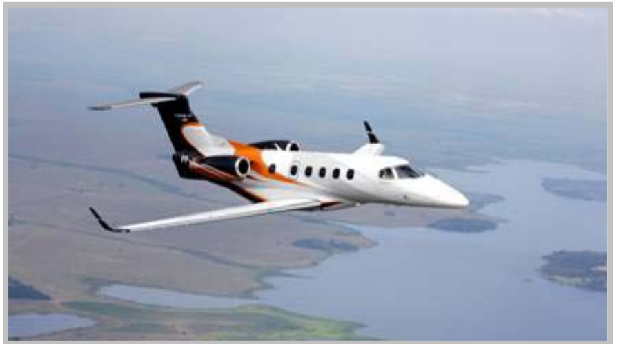
Second Phenom 300 flying over Brazil