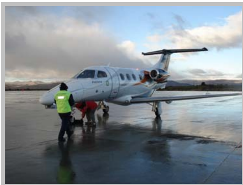
Phenom 100 Cold Weather campaign Bariloche, Argentina