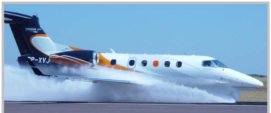
Phenom 300 tests – landing gear spray

Tests – A few days after the flight, the second Phenom 300 performed the landing gear spray, external noise and natural stall evaluations, which were all concluded with positive results.