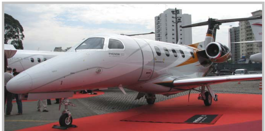
The Phenom 300 in its first public appearance alongside the Legacy 600 Labace 2008